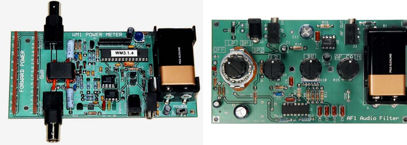
WM1 140W Computing Wattmeter and SWR Bridge

Easy to Build Test Tools and Rig Accessories